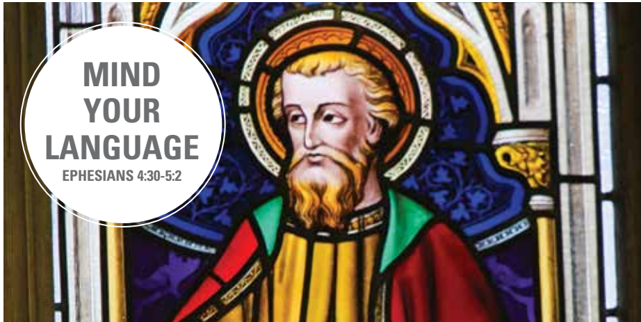
Stained glass window depicting St Paul in the Cathedral of Ghent, Flanders, Belgium

In today's second reading, St Paul offers clear instructions for how the followers of Jesus should live. Some divisions or tensions must have been surfacing among the members of the church in Ephesus, and Paul is anxious to address them.