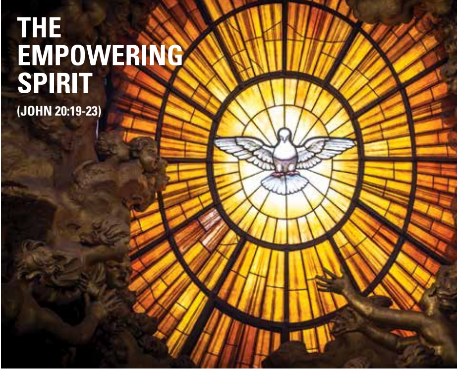
"Dove of the Holy Spirit" at Throne of St Peter by Bernini (1600s) in St Peter's Basilica, Rome

The miraculous appearance of Jesus among the disciples in a locked room shows that he is no longer constrained by physical limitations.