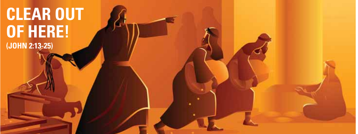
Jesus Cleanses the Temple

In the Gospel accounts of Mark, Matthew and Luke, the episode of the cleansing of the Temple follows the entry of Jesus and his disciples into Jerusalem and provides the reason for the final plot to bring about Jesus' death.