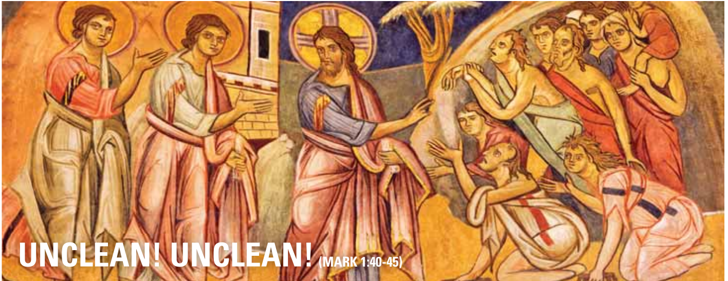
Fresco in the Baptistery of Parma, Italy of Jesus healing the ten lepers

In the Gospel tradition, there is one example of Jesus healing someone who is suffering from the condition known as leprosy.