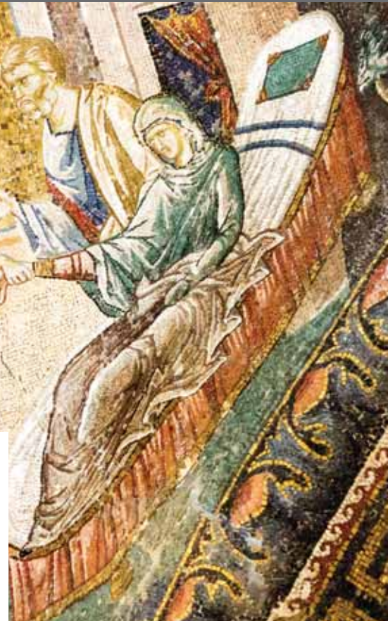
Christ healing Peter's mother-in-law, mosaic in Cora Church, Istanbul

In any discussion about the ministry of women in the Church, we might take the New Testament evidence into account, especially Paul's remark that through baptism, there is now "no longer male nor female" in Christ (Gal 3:28). We also should distinguish those customs which belong to historical and cultural systems or prejudice and which have little to do with the revealed word of God. ■